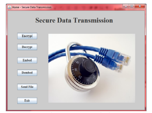
Snapshot 2: Home Window